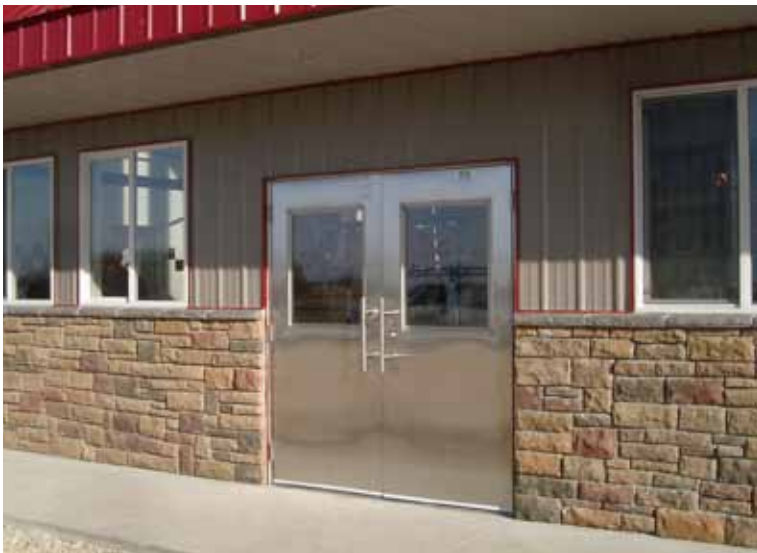
(Exterior Glen-door with stainless-steel finish)

Ideal for cold storage rooms, hog barns, processing plants, trailers, partitions, shops, freezers & coolers.