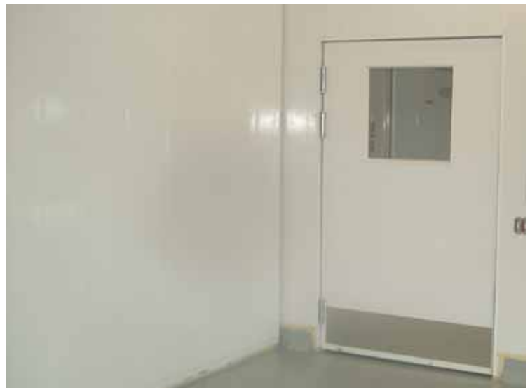
liner paneling with Glen-door